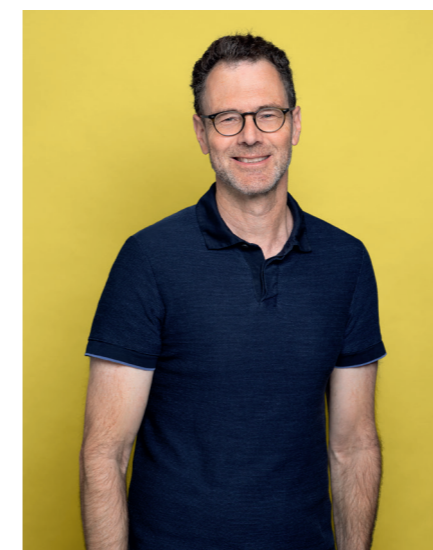
David Basin Professor of Information Security

Our study programme offers students the opportunity to combine fundamental, ground-breaking research with state-of-the-art engineering. Through their studies and projects, students are provided with a rich spectrum of intellectual tools to shape the future of computing and applications. The courses offered include all the latest and most relevant computer science topics and allow students to undertake a dive deep into specialised areas. The programme is challenging, to be sure, but upon completion, students are extremely well qualified for either ambitious industry jobs or, if they opt to do so, continuing their training by pursuing a doctoral degree in research. The personal encounters and professional exchanges with our students and young researchers from all over the world are the most valuable aspects of my work.