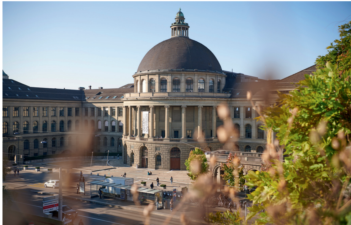
Where once Albert Einstein studied and taught: the Main Building of ETH Zurich is one of the city's landmarks.

Freedom and personal responsibility, an entrepreneurial spirit and openness to the world: Switzerland's core values were also central to the foundation of ETH Zurich. The roots of this technical and scientific university go back to 1855, when the founders of modern Switzerland created this place of innovation and knowledge. At ETH Zurich today, students find an environment that demands independent thinking, while researchers enjoy a climate that inspires them to achieve excellence. Located at the heart of Europe and part of a worldwide network, ETH Zurich develops solutions for the global challenges of today and tomorrow.